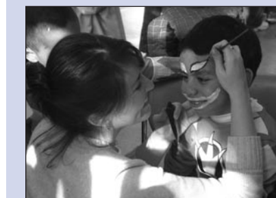
Holiday fun for the kids.

Don't delay. Learn more about what this stylish City has to offer today!