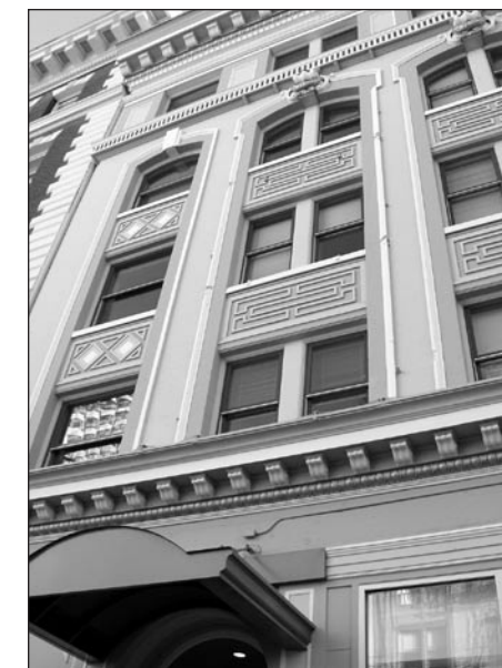
New paint brings out historic architectural details.